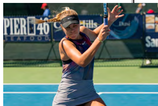
Sofia Kenin (USA) / CCPTO 2017 World Ranking #4 - 2020 Australian Open Champion