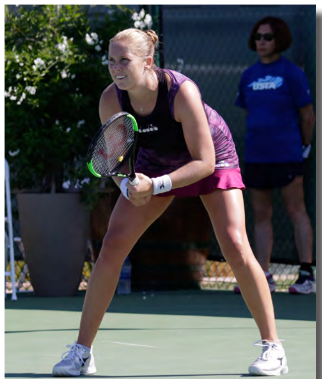
Shelby Rogers (USA) CCPTO 2019 World Ranking #48