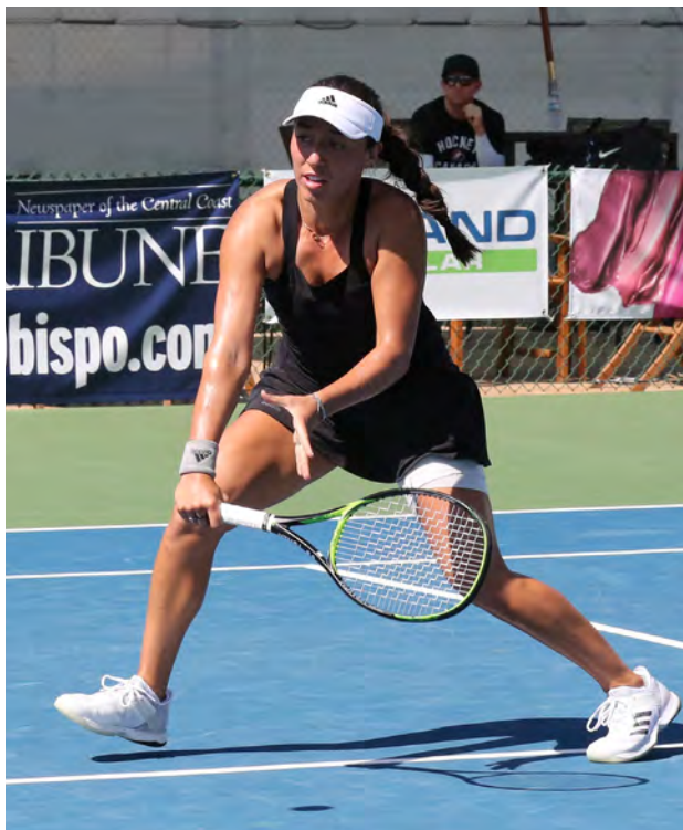
Jessica Pegula (USA) CCPTO 2018 Career World Ranking #2