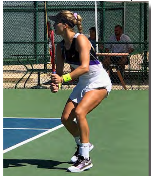
Eugenie Bouchard (CAN) / CCPTO 2019 World Ranking #5 - 2014 Wimbledon Finalist